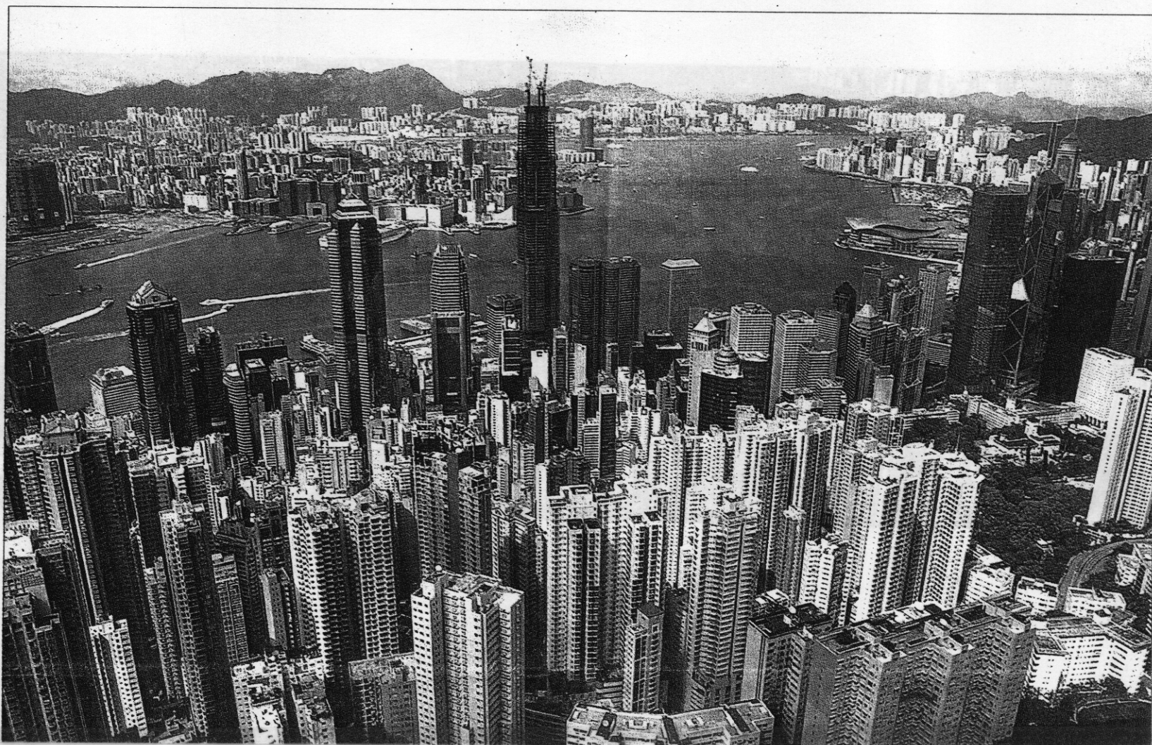
Victoria Harbour lies in a sea of high-rises from the southern part of Hong Kong Island and the Kowloon Peninsula. Star Ferry has plied these waters for more than a century.

THE GAZETTE | MONTREAL | OCTOBER 2, 2004