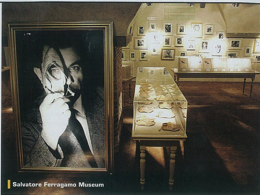
Salvatore Ferragamo Museum

A destination equally odd but considerably cheerier is the colorful and quirky Salvatore Ferragamo Museum. Ferragamo had an intense, mystical, relationship to shoes. He once said, "I love shoes. They talk to you." If you feel the same way and want a good conversation with hundreds of opulent and historic shoes,